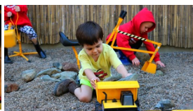
Outside Play Area