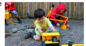
Active Play Area