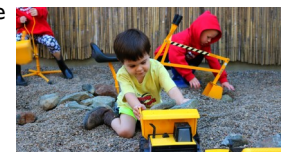
Active Play Area